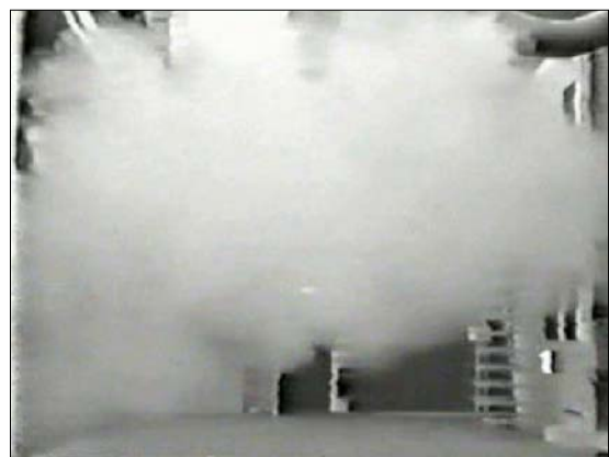
Set to „cooling“ – displacement air flow

When set to „heating“ the nozzle is open and the air is discharged downwards to increase penetration to low level.