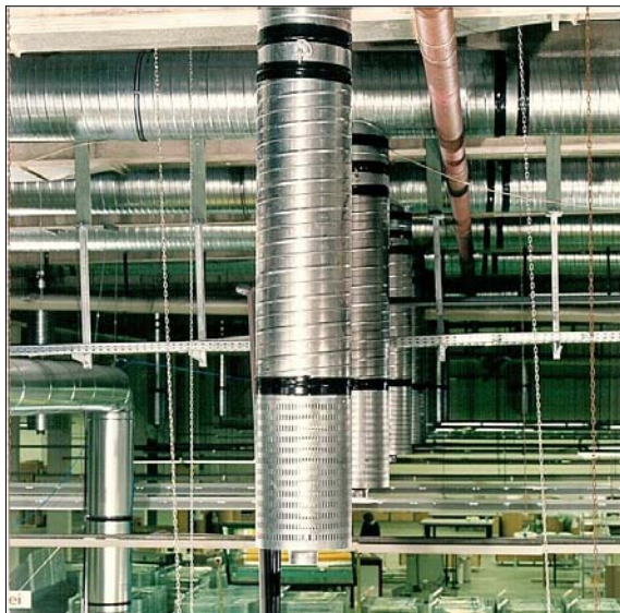
DLD without nozzle casing, Example: industrial hall

When set to „heating“ the nozzle is open and the air is discharged downwards to increase penetration to low level.