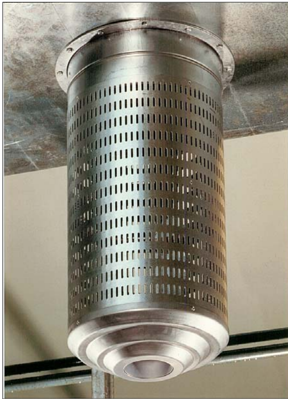
DLD with nozzle casing